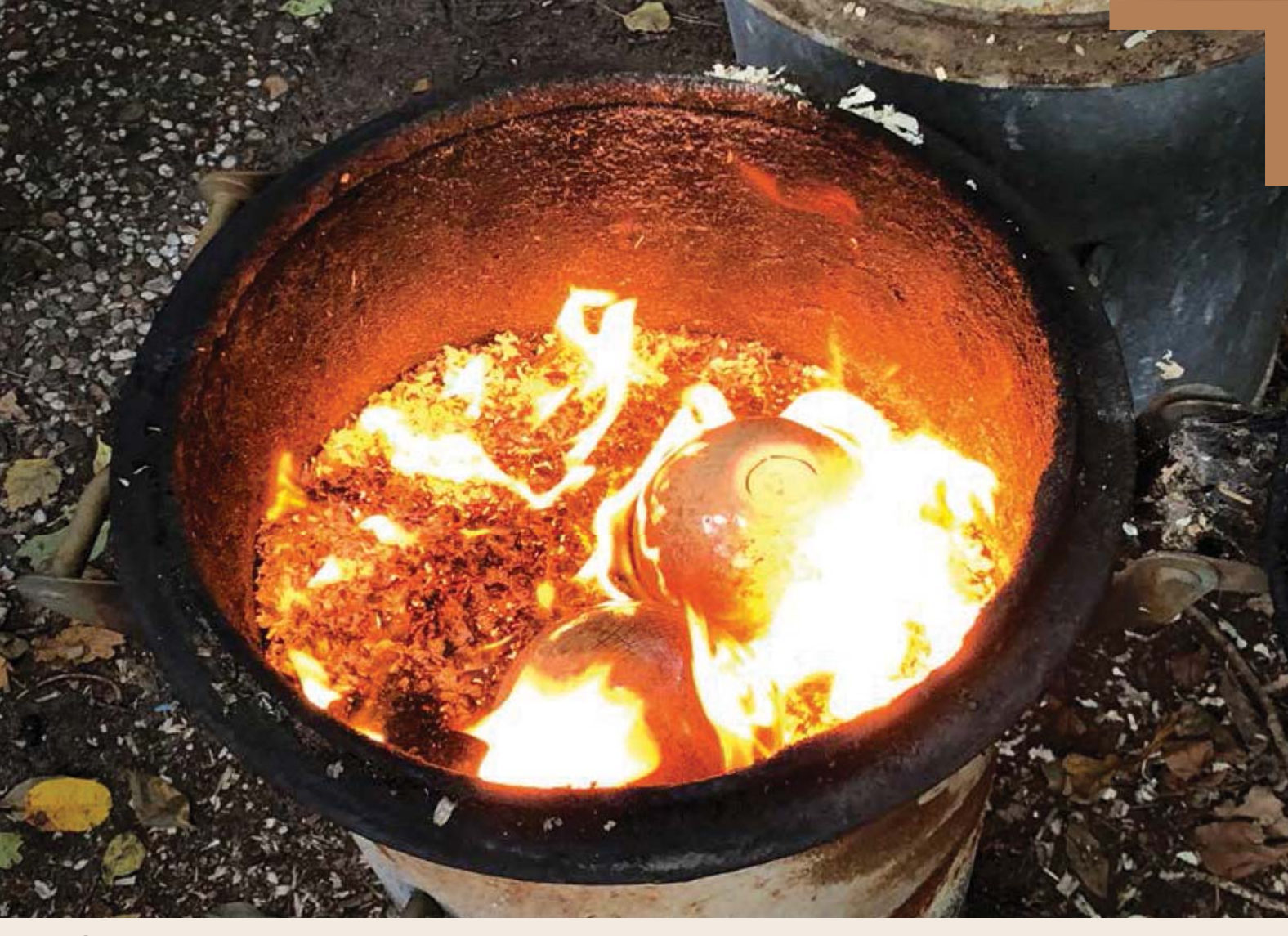
Cooling and immersion of the ceramics in leaves, straw or sawdust