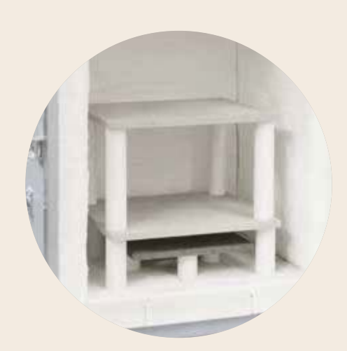
Set of furniture