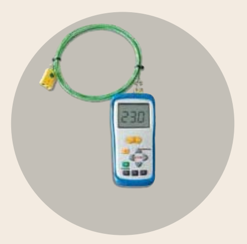
Temperature measurement device incl. thermocouple